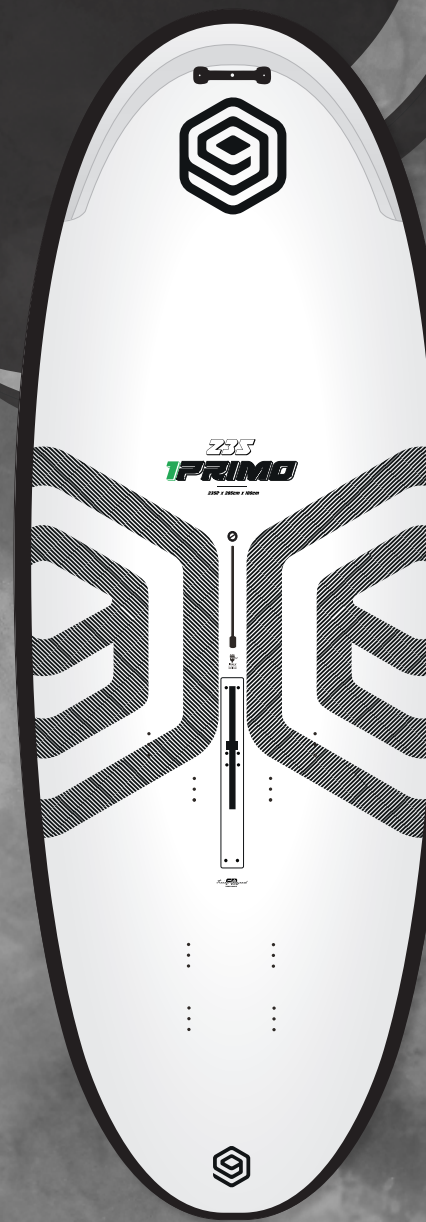
235 235lf x 285cm x 100cm