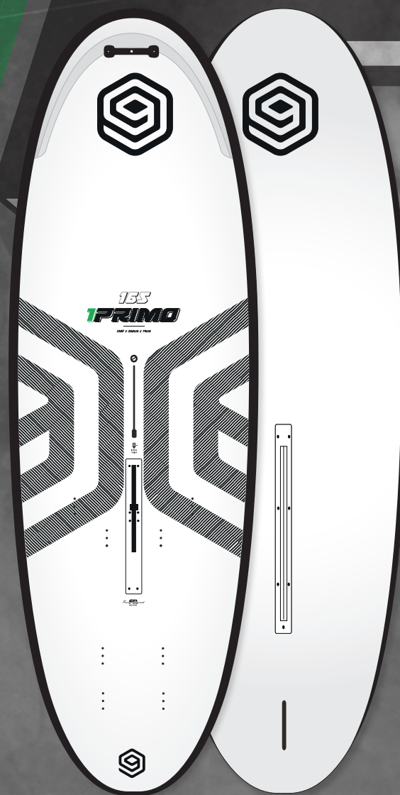
165 165lf x 260cm x 79cm